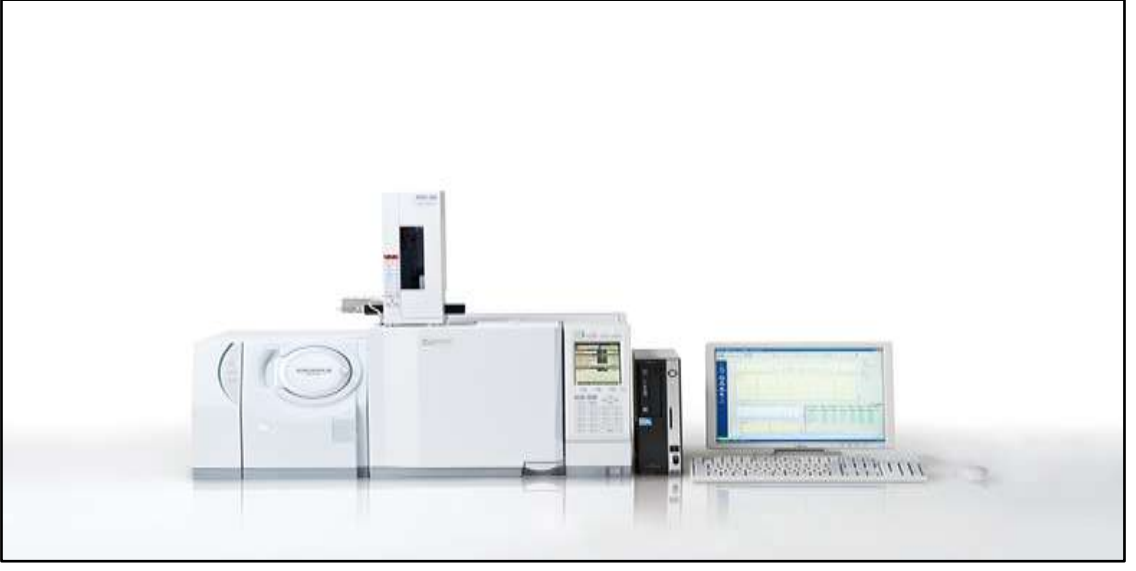
Schematic Diagram Of Gas Chromatography-Mass Spectroscopy

chromatography and mass spectrometry to distinguish various substances inside a test. GC-MS is used as an incorporate medication location, fire examination, ecological examination, explosives examination, examples, including that of material examples acquired from planet Mars during test of missions as ahead schedule as the 1970s.Analytical technique that combines the separationproperties of gas-liquid chromatography with the detection feature of mass spectrometry to identify different substances within a test sample. GC is used to separate the volatile and thermally stable substitutes in a sample whereas GC-MS fragments the analyte to be identified based on its mass. The further addition of mass spectrometer in it leads to GC-MS/MS. Superior performance is achieved by single and triple quadrupole modes.